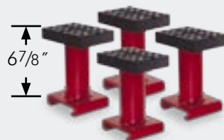
4 high adapters included