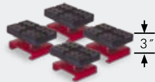
4 low adapters included