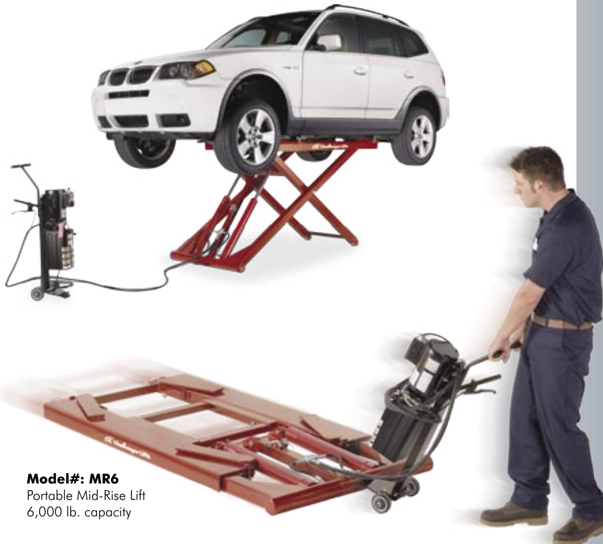
Model#: MR6 Portable Mid-Rise Lift 6,000 lb. capacity